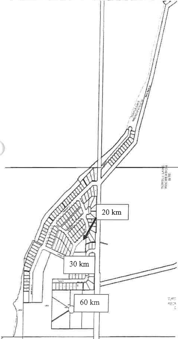
Turtle Lake Lodge Subdivision